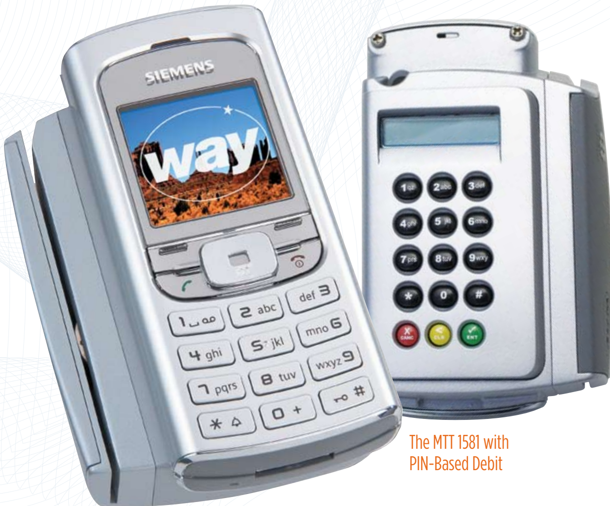
The MTT 1581 with PIN-Based Debit

Total Weight: 5.5 oz. (156g) Printer: 8.8 oz. (250g)